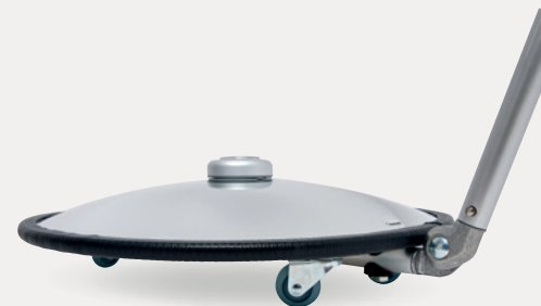
Vumax 322 R is mounted on wheels