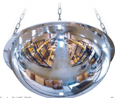
Code 3695 PC